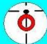
40 YARD SIGHT PICTURE